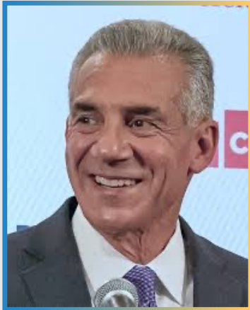
Jack Ciattarelli Republican