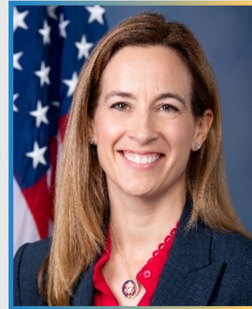
Mikie Sherrill Democrat