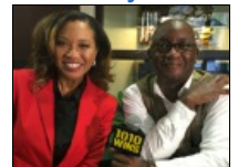
Black History Month...