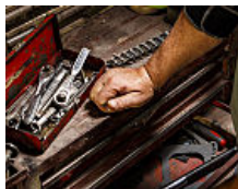
Classic Auto Owner's Guide to What It Takes to Restore Cars (3M)