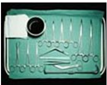
4 Surgeries to Avoid (AARP)