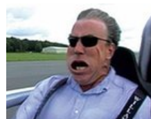
Ready to upgrade to a faster car? Check out the top 5 fastest... (Motor Guides)