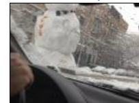
Another Winter Storm Hits...