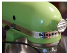
Must Have Appliances Being Sold for Next to Nothing (LifeFactopia)