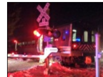
Deadly Metro-North Accident...